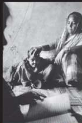
A child severely affected by the gas

Most of those exposed to the poison gas came from poor, working-class families, of which nearly 50,000 people are today too sick to work. Among those who survived, many developed severe respiratory disorders, eye problems and other disorders. Children developed peculiar abnormalities, like the girl in the photo.