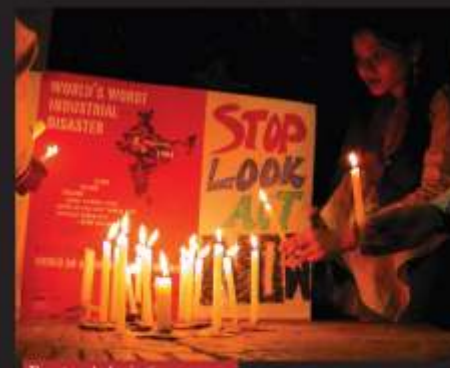
The struggle for justice goes on

Most of those exposed to the poison gas came from poor, working-class families, of which nearly 50,000 people are today too sick to work. Among those who survived, many developed severe respiratory disorders, eye problems and other disorders. Children developed peculiar abnormalities, like the girl in the photo.