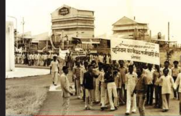
Members of UC Employees Union protesting.

The disaster was not an accident. UC had deliberately ignored the essential safety measures in order to cut costs. Much before the Bhopal disaster, there had been incidents of gas leak killing a worker and injuring several.