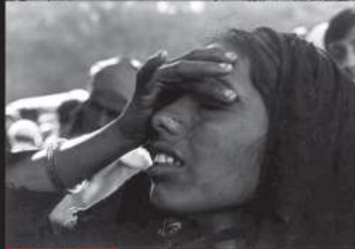
The next morning