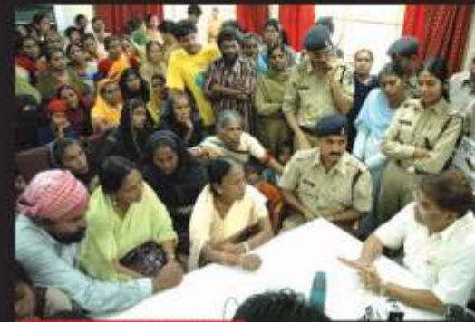
Gas victims with the Gas Relief Minister

Despite the overwhelming evidence pointing to UC as responsible for the disaster, it refused to accept responsibility.