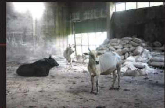
Bags of chemicals lie strewn around the UC plant

UC stopped its operations, but left behind tons of toxic chemicals. These have seeped into the ground, contaminating water. Dow Chemical, the company who now owns the plant, refuses to take responsibility for clean up.